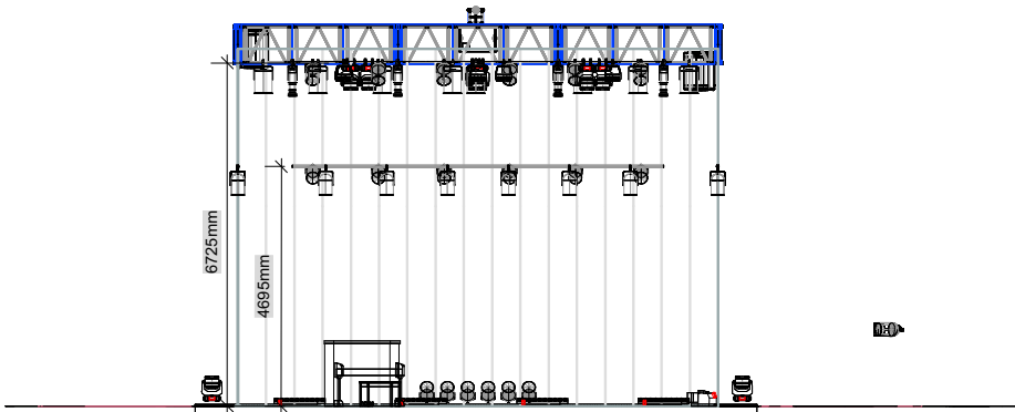
Front view Scale: 1:100